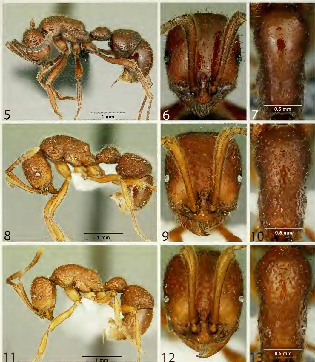
FIGURES 5–13 Profile, head in full-face view and mesosoma in dorsal view of Proceratium avium workers: Figures 5–7: CASENT0059014, BLF12136, collected May 30, 2005; Fig. 8–10: MCZTYPE32216 holotype of Proceratium avium collected 1 Apr. 1969; Fig. 11–13: MCZTYPE35017 holotype of Proceratium avioide collected 30 March 1969.

JUSTIFICATION OF SYNONYMY. — Brown (1980) collected three series of Proceratium at Le Pouce in 1969, one on March 30, and two on April 1. The latter were located less than 500 meters from the March 30 collecting site. He described both of these samples as Proceratium avium (Brown 1974). De Andrade (Baroni Urbani and de Andrade 2003) reexamined these three collec-